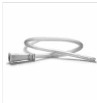
Astra Tech Ltd, LoFric® Plus: PVC-free hydrophilic catheter