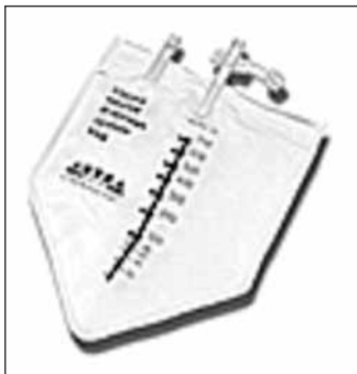
Astra Tech Ltd, PVC-free Drainage Exchange Bag.