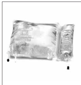
Haemopharm, Biobags, Various volumes, Multilayer Plastic - non-PVC