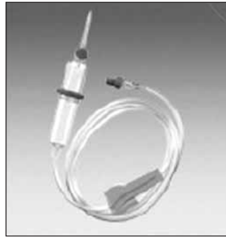
Intrafix Safeset, IV Administration set (gravity infusion)