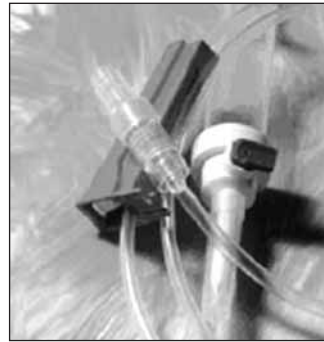
Codan Triplus AB - V86