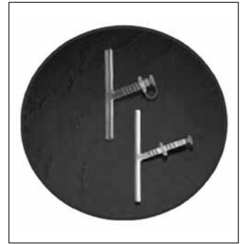
Kapitex Healthcare Ltd, 3200 Series Pediatric Safe-T-Tube™