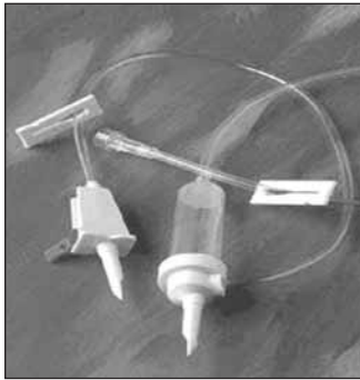
Codan Triplus AB - Mono-Set, IV Mixture Unit