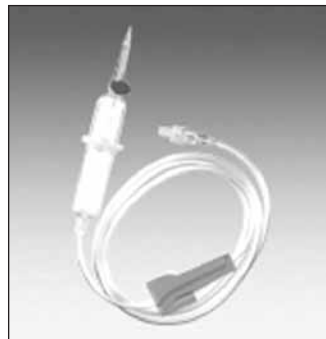
B Braun, Intrafix® Primeline Classic/Comfort. DEHP- and PVC-free material