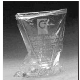
Guest Medical Limited, Autoclave Disposable Bags. Polypropylene or HDPE