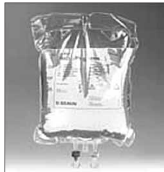
B. B Braun, EcobagR PVC-free bag 3000, 5000 ml.