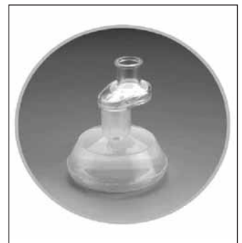
Kapitex Healthcare Ltd, Emergency Resuscitation Mask