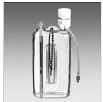
B Braun, Redyrob® Trans Plus - Closed wound drainage system for use with Redyrob® Comp